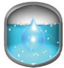
Activated Oxygen Injection