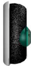
Carbon Block Filter