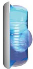
80 GPD Reverse Osmosis Membrane